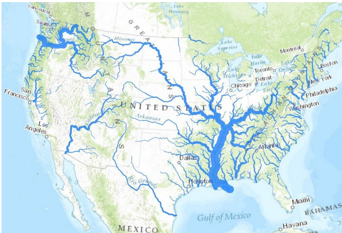
[AMERICA] a land the rivers divide – ISAIAH 18:2,7 (NKJV)