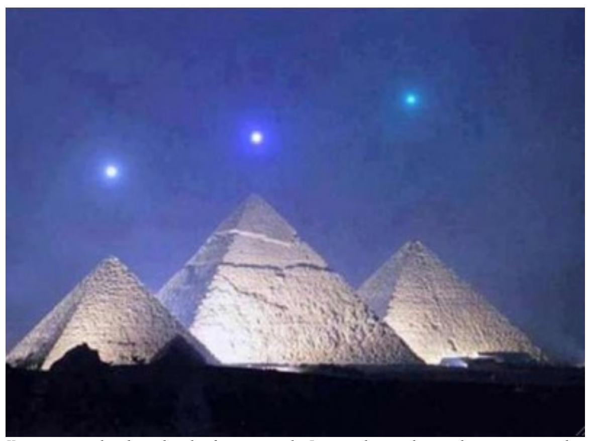
You are wearied in the multitude of your counsels; Let now the astrologers, the stargazers, and the monthly prognosticators stand up and save you from what shall come upon you. -Isaiah 47:13. Egypt and America, countries knowledgeable in astrology, stargazing, and horoscope forecasts. American astronomers, cosmologists, and theoretical physicists often deny the existence of God.